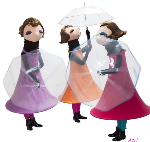
Balladines rainy day