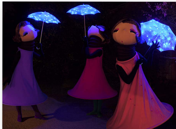
Balladines at night under their little starry sky